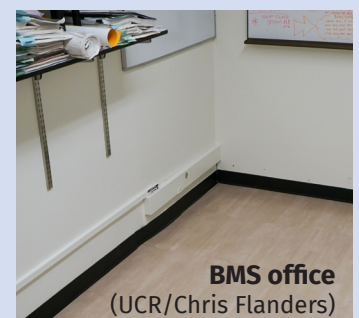
BMS office