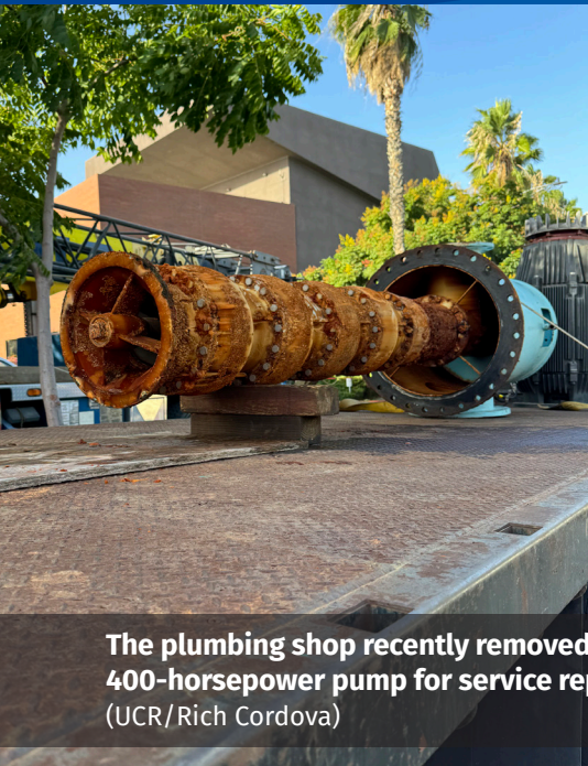
The plumbing shop recently removed a 400-horsepower pump for service repairs.